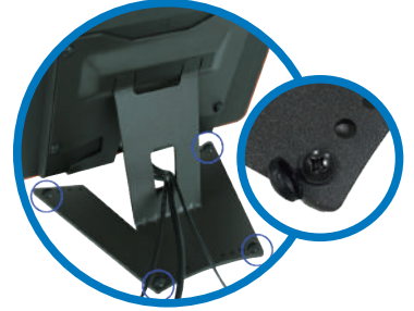
Hidden Screws For Wooden Table FIXED