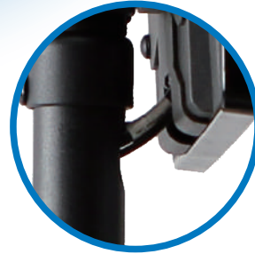
Cable hidden design